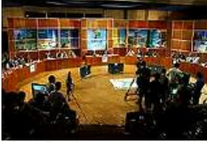
Telesur will start live programming on Oct. 31

MONTEVIDEO, 7/22 (IPS)—Sunday will be the first day of broadcasting for a new Latin America-wide TV network aimed at competing with U.S. and European international news stations.